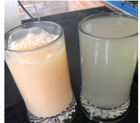
Outlet to final sewer on the right

This is an ongoing project and the project team continue to look for ways to improve it. For instance a small mixer is to be added to the v-notch weir tank in order to increase pH levels back to consent.