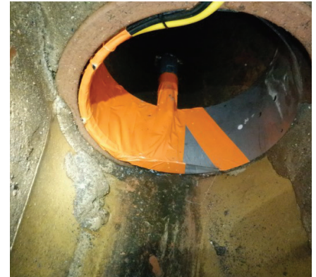
Flow sensor position

All monitors were successfully installed after rigorous assessment of ideal locations across campus. This installation has consequently led to a five-year data services contract and an initial first maintenance contract. Next steps will be to deliver on-going maintenance for the batteries and ensure data quality throughout the duration of the project.